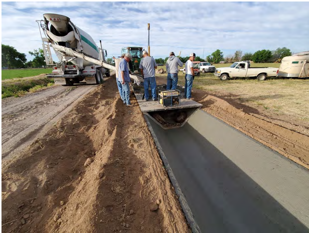
A concrete ditch pour in Socorro. This was an NRCS project, but since they won't work on Saturday, district staff provided technical assistance.

Agriculture is the most active segment of our cost share program. This year we assisted landowners with four land leveling projects moving 4,364 cubic yards of dirt on 23 acres; installation of 886 feet of twelve inch irrigation pipeline benefitting 7.8 acres; installation of 167 feet of fifteen inch irrigation pipeline benefitting 2 acres; installation of 1,600 gallons of rain water storage for supplemental orchard irrigation, benefitting 2 acres; drilling of two livestock wells with solar pumps benefitting 647 acres; two 10,000 gallon storage tanks for livestock on 2 ranches, benefitting 645 acres; two Middle Rio Grande Conservancy ditch turnout upgrades from 24" to 30" and 18" to 30"; installation of a greenhouse shade structure benefitting a small organic tomato farm, and removal of Salt cedar re-sprouts on 9.5 acres..