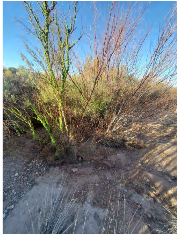
Treated Salt cedar on the Armijo Ranch