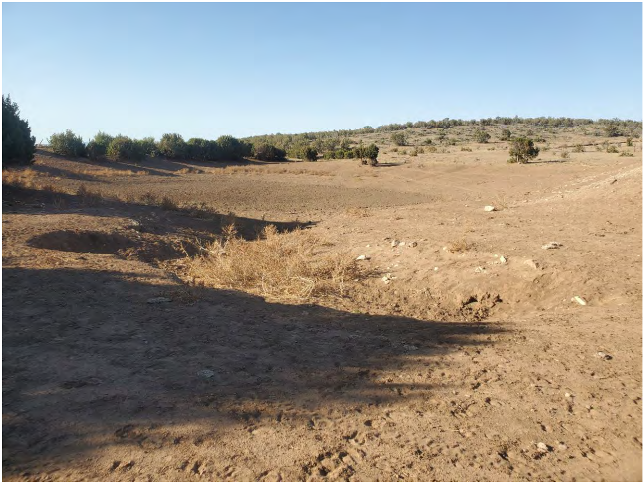
Cascading retention dams with treated Spiny cocklebur on the Chupadera Mesa.