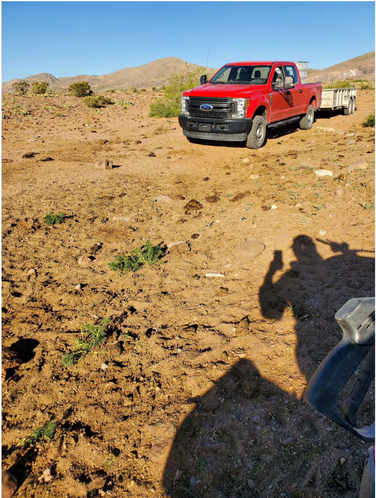
African rue on the Pound Ranch. A-1 Ready Mix is absolutely infested with African Rue, and they use this road heavily. They are distributing the plant throughout the county, and refuse to treat it.