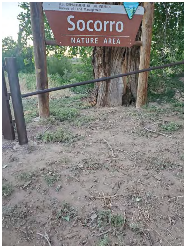
Treated weeds at the Socorro Nature Area

Treatment of Salt cedar has become a difficult issue in New Mexico. The “Salt cedar Bug” is now fully distributed throughout the state, and the infestation level is high. The bugs appear to go through 2-3 generations per growing season, causing the trees to turn brown and then green again with each generation. Of course, spraying is only effective when the tree is growing and healthy, i.e. green. This change can happen quickly, and I often reach a destination to spray the Salt cedar, only to find out that is brown. Due to the tremendous scope of Salt cedar in the valley, timing is equally important and difficult.